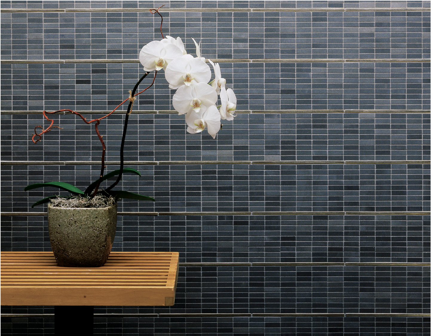
Foundry Art Straight Line 10-inch liner cast in White Bronze

LINDEN WORKSHOPS TILE ARTISTS · SINCE 1990 MADE IN THE UNITED STATES